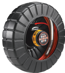
rM200 D2B Catalog No. 47543