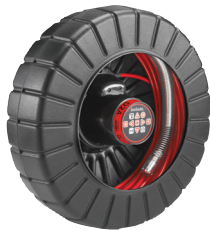
rM200 D2A Catalog No. 47553