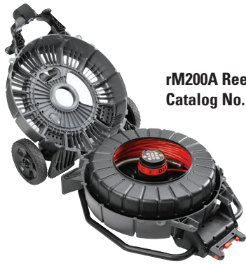
rM200A Reel Catalog No. 42353