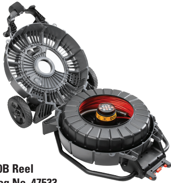
rM200B Reel Catalog No. 47533